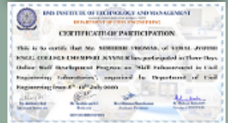
PARTICIPATION BY MR.NIMEESH THOMAS