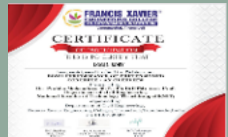
PARTICIPATION BY MR.LOGY N BOBY