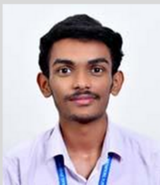
Nakul Ganesh Technologics