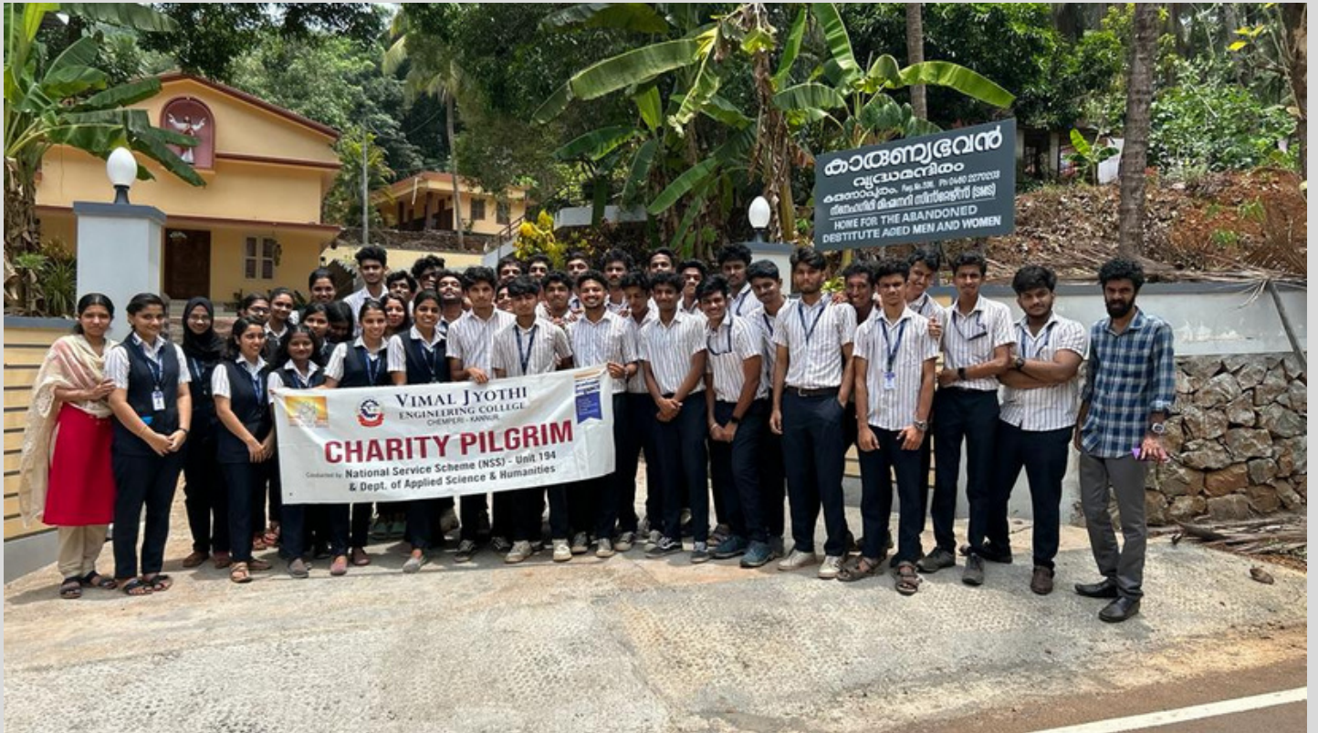
S2 EEE Students visited "Karunyabhavan" as part of Charity Pilgrim on 29th April 2023